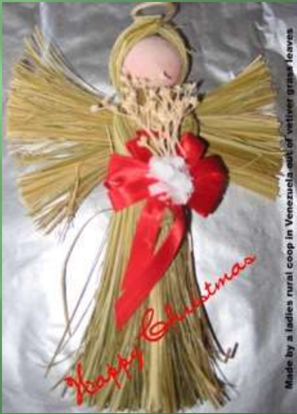
Made by a ladies rural coop in Venezuela out of vetiver grass leaves